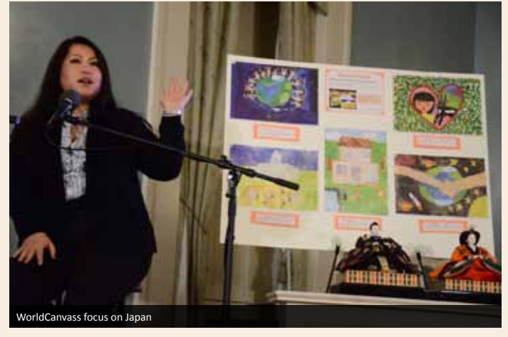
WorldCanvass Appearance March 2, 2012

I was a guest on the University of Iowa WorldCanvass program on Japan, where I introduced the Japanese children's artwork. WorldCanvass is a live and recorded program on Iowa Public Radio and cable television stations. The program is also available as a podcast.