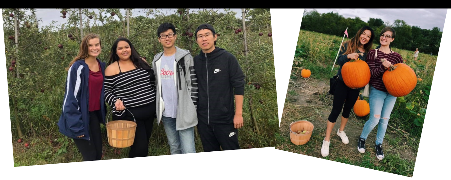
Profile of International Students and Scholars, The University of Iowa, Fall 2018 Page 6

The <u>Friends of International Students</u> organization is a community group that has existed for nearly five decades, matching international students with local community members and families. It is often the only opportunity many international students have to interact with U.S. families or be invited into U.S. homes.