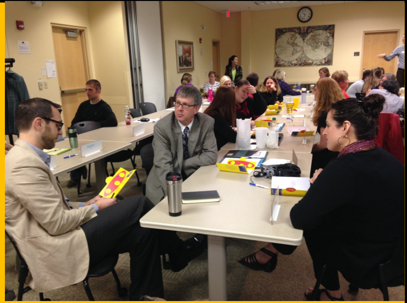
Staff members participate in the Redundancia exercise during a BGC session.

The growing international student population has increased the need for staff throughout the university to be trained in intercultural skills, which is provided through the Building Our Global Community workshop series and other