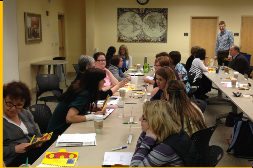
Staff members participate in the Redundancia exercise during a BGC session.

The growing international student population has increased the need for staff throughout the university to be trained in