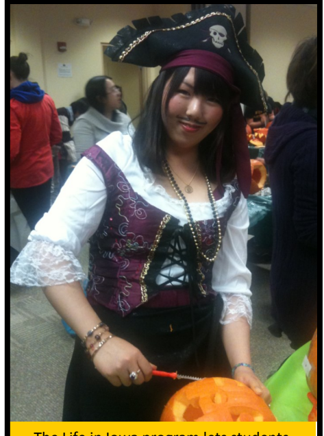
The Life in Iowa program lets students experience fun American traditions such as carving Jack-o-Lanterns or building gingerbread houses in addition to learning practical things like creating résumés or volunteering in the community.