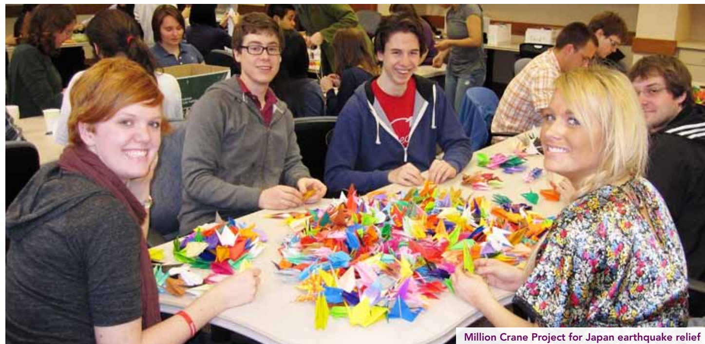
Million Crane Project for Japan earthquake relief